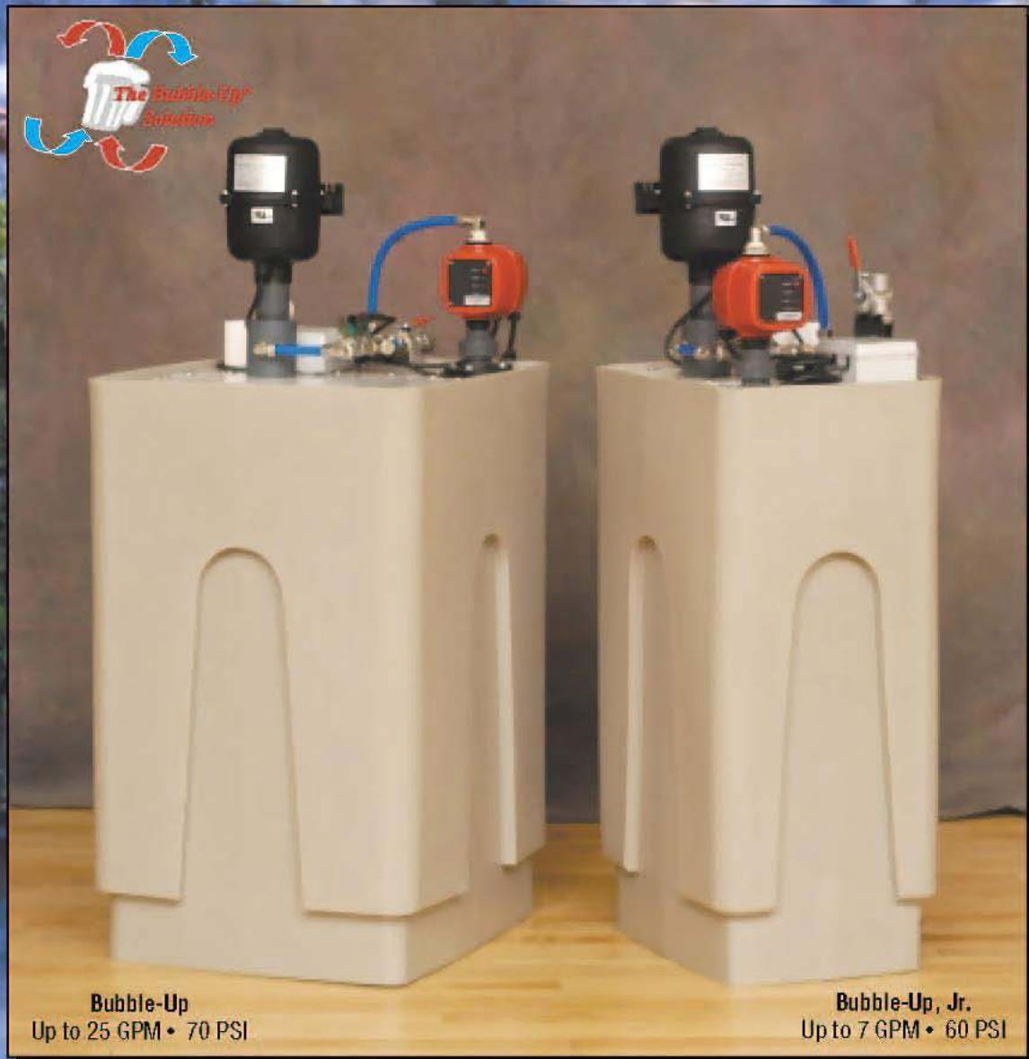
Bubble-Up Up to 25 GPM • 70 PSI

At last, an answer to radon plagued water. INTRODUCING THE BUBBLE-UP SYSTEM.